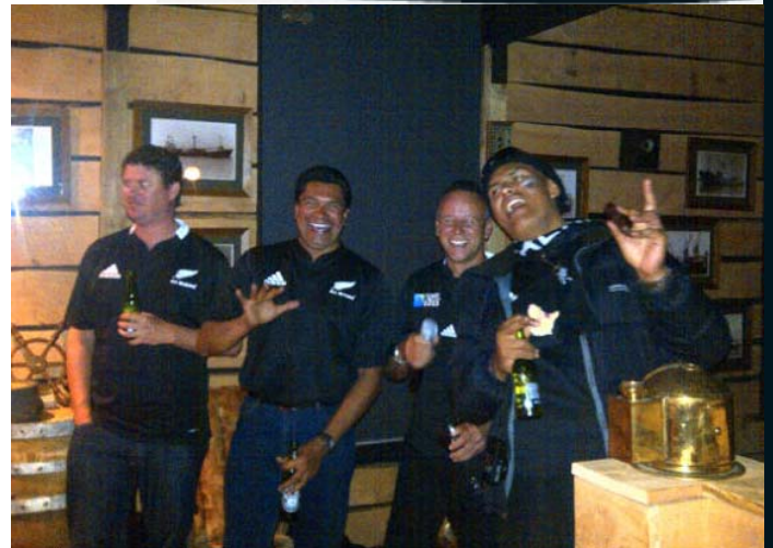
Clients from Raro after the final at Crow's Nest.