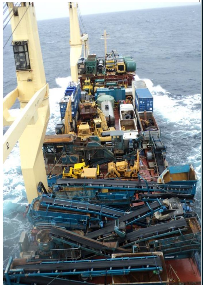
Southern Reef with a full consignment of Downers machinery, steaming to Christmas Island

In October the Southern Reef was chartered by Downers to load a consignment of machinery in Tauranga to be used as part of their contract to reseal the airport runway at Christmas Island. Loading the consignment required careful planning to ensure everything fitted on the vessel, it very much became a jig saw puzzle. Howard Roscoe from Reef Shipping was on hand to supervise the load. A special mention should be made of Capt Anasa Lalanabarabi who skilfully managed the discharge at Christmas Island. At times sea conditions were such that the ocean swell stopped cargo operations and the vessel had to leave the berth and go to anchor. Port facilities and shore handling equipment are limited at the port in Christmas Island and this tested the skills of everyone involved, however the shipment was handled successfully. In April the machinery will be returned to NZ.