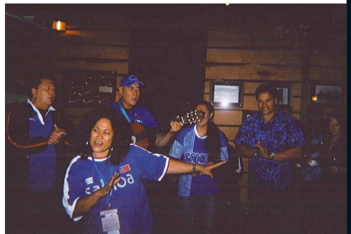
Samoan supporters celebrate victory over Fiji

What an outstanding RWC 2011 New Zealand and the world recently enjoyed, and for New Zealanders, the tournament was topped off by Captain Richie McCaw lifting aloft the Webb Ellis trophy, the coveted symbol of world rugby supremacy, last won by New Zealand in 1987. Reef Group was privileged to host over 400 valued customers and friends over the course of the tournament both at all Eden Park games experience and pre and post match drinks and food at the Crow's Nest, the purpose built hosting facility situated five minutes walk from Eden Park. The exercise provided an excellent way to thank our many valued customers for their patronage and support over the years, plus bring a wide array of people from a broad cross section of businesses associated with Reef Group together in a fun environment, often ending the evening with karaoke, ukulele and guitars. The occasions were full of colour and frivolity with guests proudly representing their teams with much colour, fun and friendly banter. For Reef's many customers and friends based in the Pacific it was a wonderful opportunity to see their own teams run out in a RWC fixture at Eden Park. For the majority of guests who supported the All Blacks, the party went late in the evening especially after the epic final with France. All in all, whether your team were winners or losers, the Reef hosting experience ensured that the hosting experience at the Crow's nest, were just as much as a highlight as the games themselves.