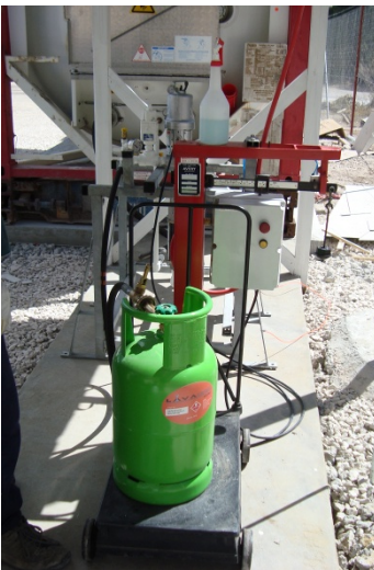
Cylinder being filled